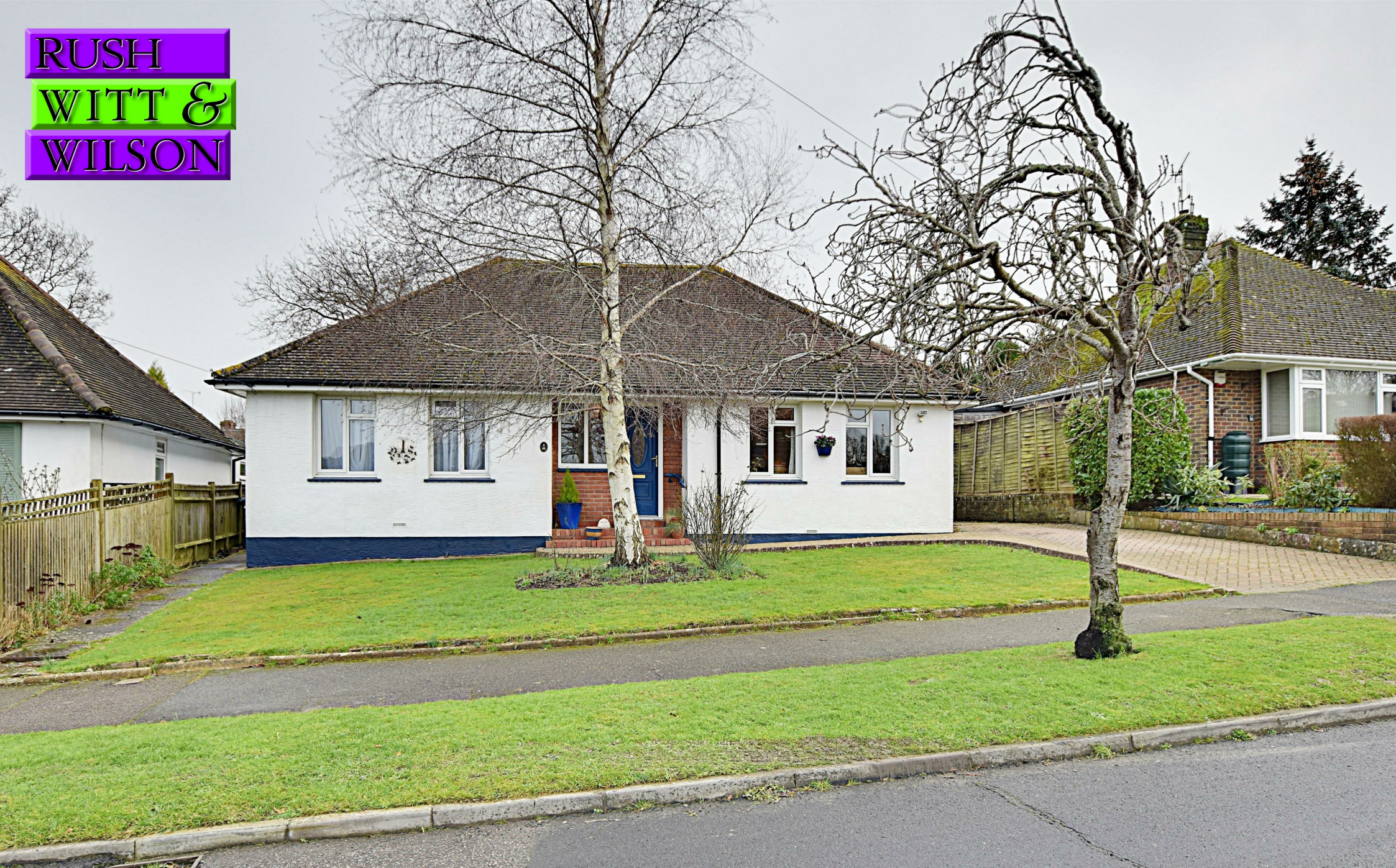
8 The Gorseway, Bexhill-On-Sea, East Sussex TN39 4PR £435,000